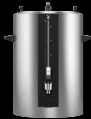
HEATED THERMAL CONTAINER (20L)