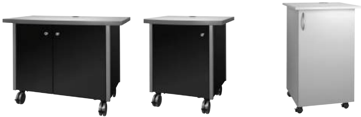
MOBILE COFFEE STATION 125+ / 85+

DELIVERING COFFEE INDULGENCE, IN TOTAL AUTONOMY