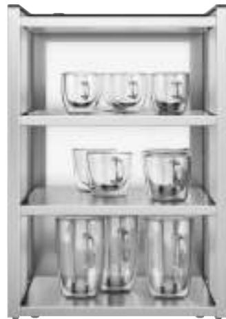
CUP RACK, WIDE

PERFECTLY WARMED CUPS, STYLISHLY DISPLAYED