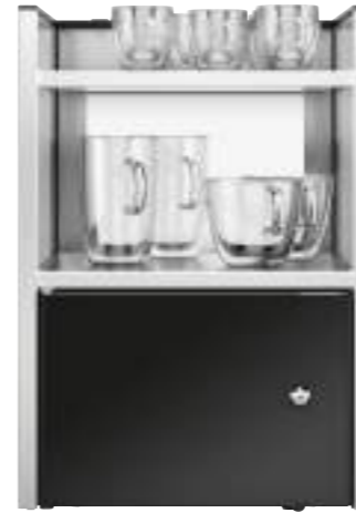
CUP & COOL, WIDE

ONE UNIT, TWO FUNCTIONS: WARMING AND COOLING