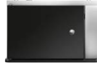
UNDER-MACHINE COOLER (WMF 9000 S+)

The large capacity of this Countertop Cooler makes it suitable for use with either one or two WMF coffee machines, with milk hose routing on both the left and right sides. Milk temperature and milk empty sensors are available as an option.