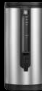
THERMAL CONTAINER (2.4L)

The range of thermal containers for use with the WMF 9000 F includes an insulated pot with a 40-litre capacity and a 20-litre model, as well as a 2.4-litre model which can be filled from the pot brewing arm, and is also suitable for use with the WMF 9000 F (Internal Storage).