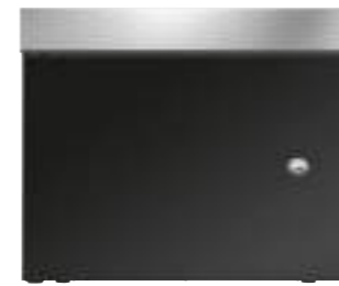
COUNTERTOP COOLER (LARGE)

This model boasts a removable milk tank and offers the option of sensors for milk temperature and a milk empty message.