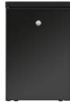
COUNTERTOP COOLER (MEDIUM)

Available either with or without a large digital display on the front panel, the two variants of WMF's small Countertop Cooler both have a removable milk tank with a 3.5-litre capacity, and each is fitted with a thermostat and separate on/off switches. Suitable for self-service venues, they are lockable with a removable seal.