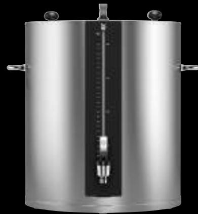
HEATED THERMAL CONTAINER (40L)

CONSISTENT TEMPERATURE FOR CONSISTENT TASTE