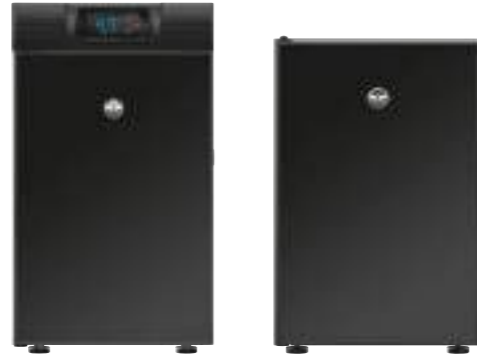
COUNTERTOP COOLER (SMALL)

Designed to be placed between two WMF coffee machines or next to a single machine, this Countertop Cooler features a removable 10.5-litre milk tank and a digital display showing the milk temperature.