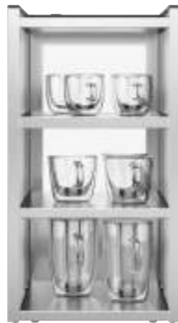
CUP RACK, NARROW

Made with high-quality, easily cleanable stainless steel and shatterproof glass, WMF cup racks are designed to be positioned directly next to the coffee machine. So your cups will always be close at hand, and just the right temperature. Transparent side panels make for easy inspection, and coloured LED lighting can be adjusted to suit your venue.