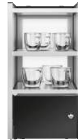
CUP & COOL, NARROW

Contained within the same footprint as a standard cup warming rack, WMF Cup&Cool units combine both cup warming and milk cooling functions. For maximum hygiene, the milk tank is removable, easy to clean and easy to fill, while the optional milk volume sensor lets you know when to refill. The lockable door is ideal for self-service venues.