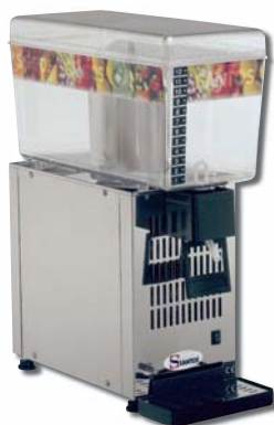
34 - 1 (single bowl) 12 liter capacity