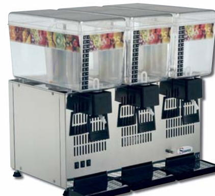
34 - 3 (triple bowl) 3 x 12 liter capacity