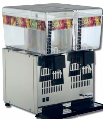
34 - 2 (twin bowl) 2 x 12 liter capacity