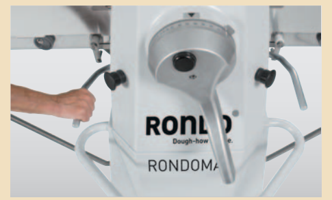
As an option, the Rondomat is available with a reversing lever. This is practical when you stand adjacent to the machine to get a better view of the dough band.