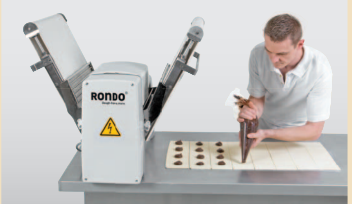
When not in use, the tables are simply folded up and you gain valuable working space.