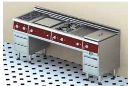
Wall Suite with bridge units to allow roll under refrigeration.