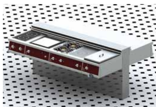
Central island of bridge units suspended on central services wall.