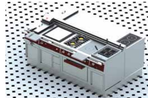
Central island cooking suite of bridge units on base supports and freestanding units.