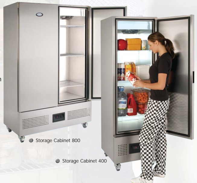
● Storage Cabinet 800