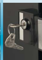
Lockable storage for peace of mind