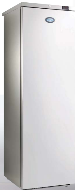
● Storage Cabinet 410 stainless steel optional finish

The low cost Foster 410 range is perfect for the smaller business or for large chains with a specification that outshines all other budget products on the market.