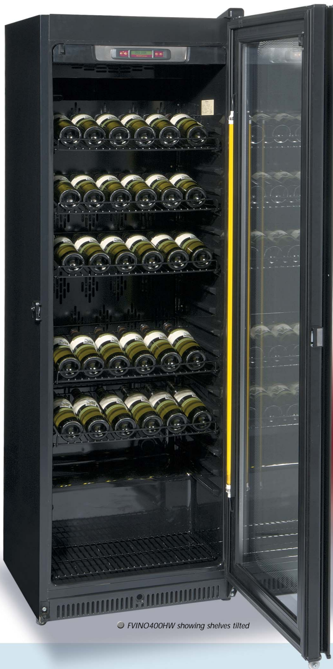
FVINO400HW showing shelves tilted