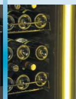
Effective coloured illumination